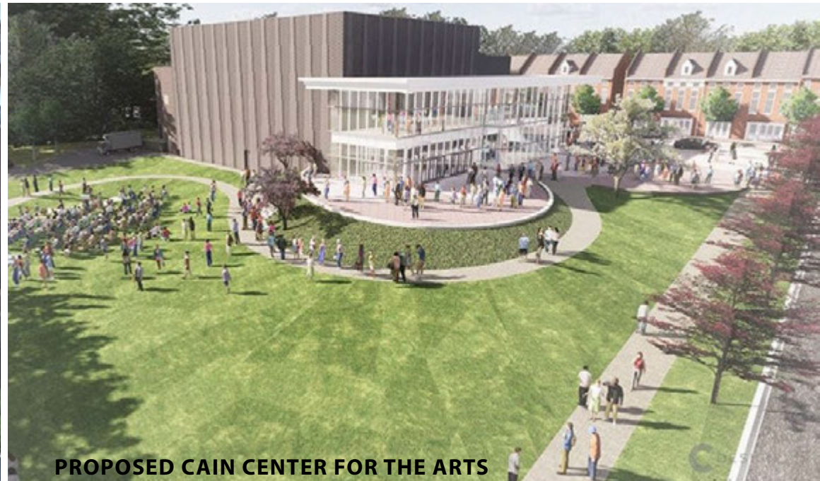
PROPOSED CAIN CENTER FOR THE ARTS

"The information contained herein was obtained from sources believed reliable, however, no guarantees, warranties, or representations have been made as to the completeness or accuracy thereof. No liability assumed for error or omissions."