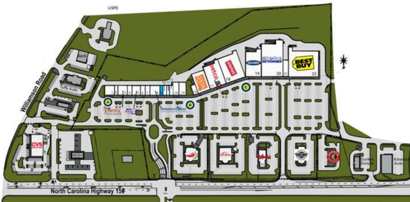
Existing Winslow Bay Shopping Center